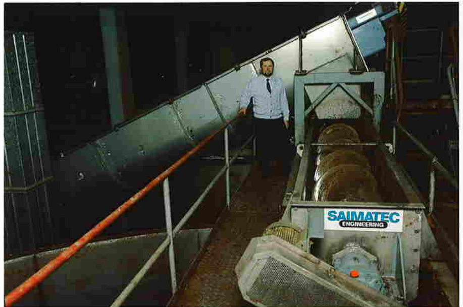
Enso-Gutzeit Oy, Tainionkoski Mill, screw conveyors for pulp. Inclined screw dia 900 mm x 14 000 mm, horizontal screw dia 630 mm x 8 000 mm, capacity 270 i-m 3 /h.

Saimatec screw conveyors have been dimensioned, designed and made on the ground of many years' practical knowledge specially for use in process industry. That's why the Saimatec screw conveyors are unquestionably reliable. Screw conveyors are used as normal conveyors, as discharging, feeding and vertical screws, as well as linearly moving and rotating screw dischargers. Saimatec screw conveyors are made of different kinds of material for very dissimilar operation functions. By customers' request our conveyors have either adjustable or standard speed.